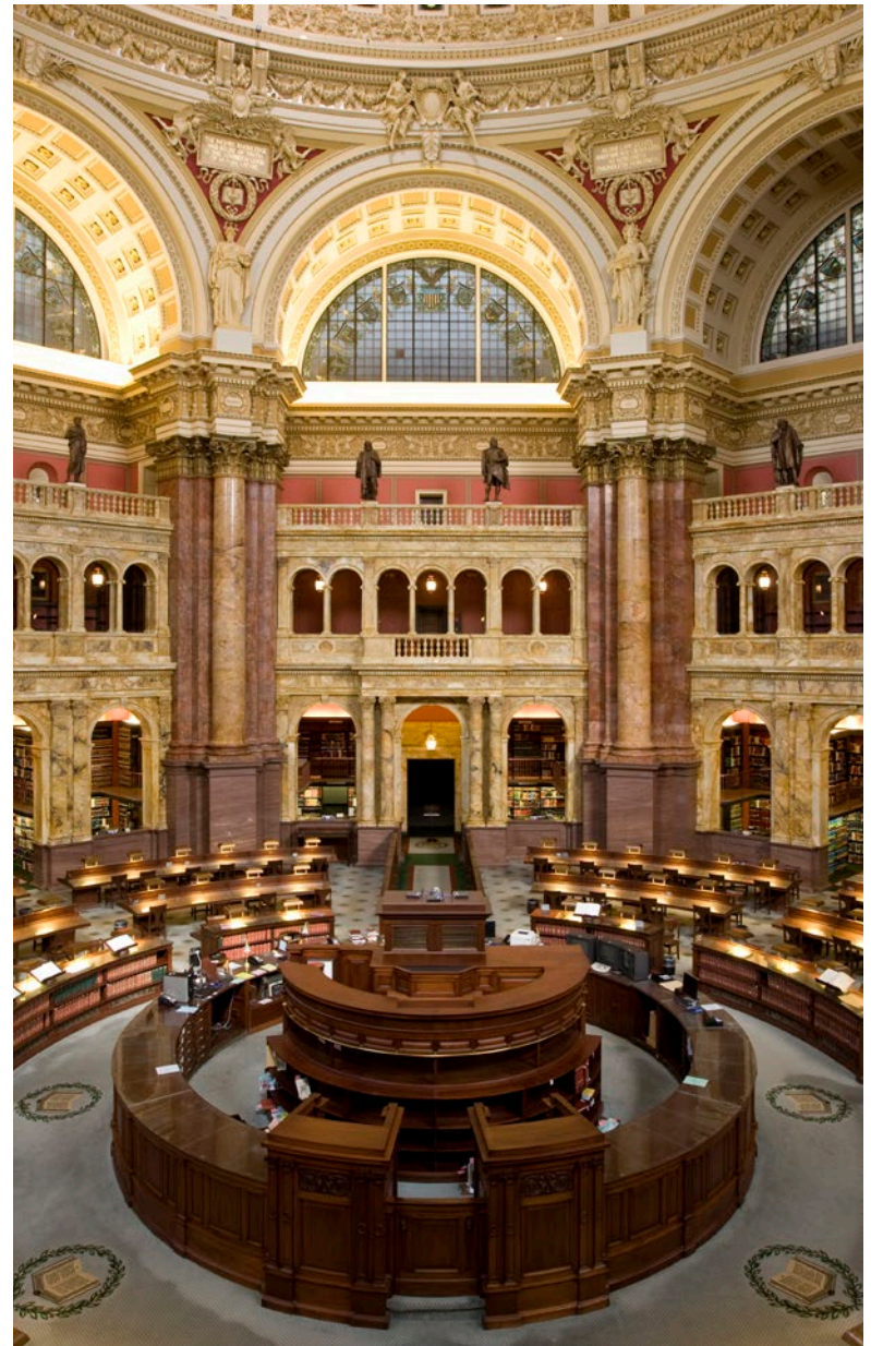
Main Reading Room at the U.S. Library of Congress, Washington, D.C.

In Big History we want you to pay attention to the questions these scientists ask. Also, pay attention to the tools and evidence they use to answer their questions.