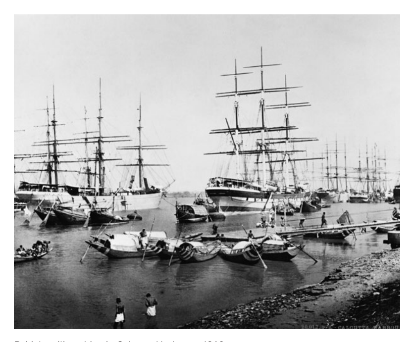
British sailing ships in Calcutta Harbor, c. 1860

Industrialization began in the United States when Samuel Slater emigrated from Britain to Rhode Island in 1789 and set up the first textile factory on U.S soil. He did this from memory, having left Britain without notes or plans that could have been confiscated by British authorities. Francis Cabot Cowell. of Massachusetts, visited Britain from 1810 to 1812 and returned to set