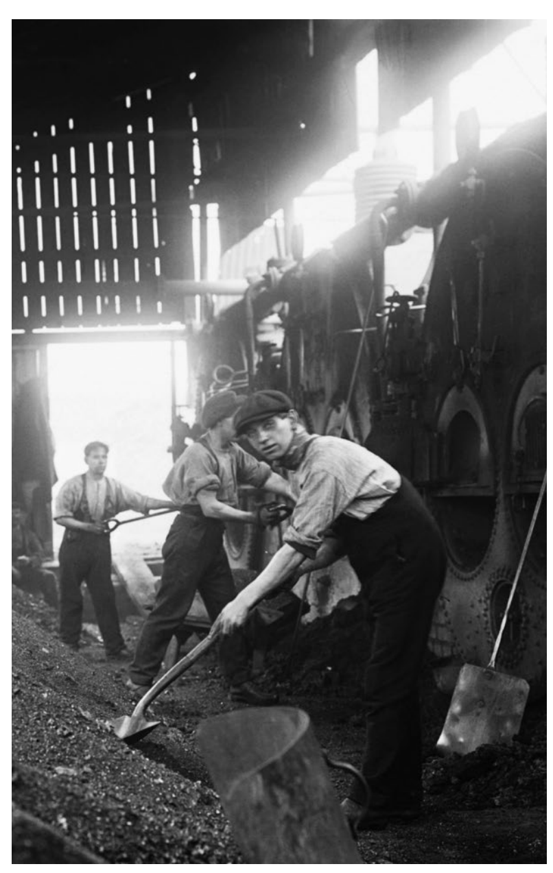
Workers shovel coal in England, 1912