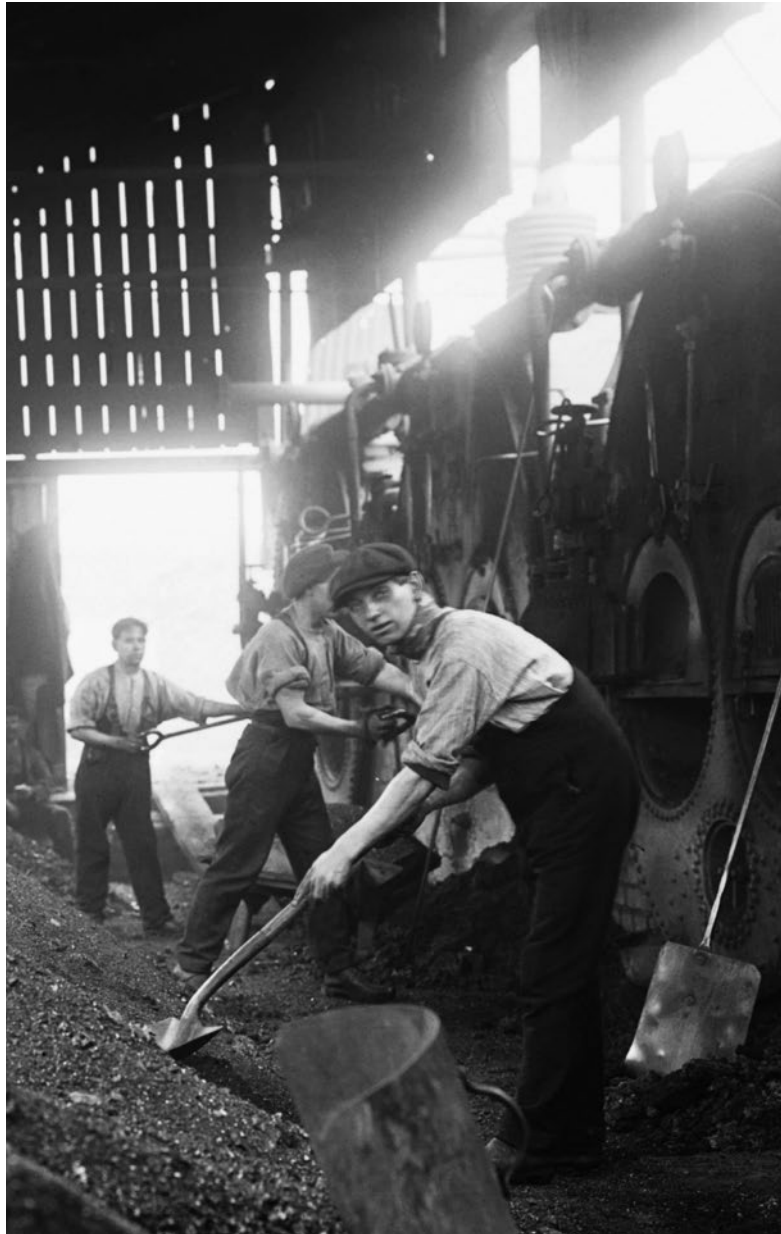
Workers shovel coal in England, 1912