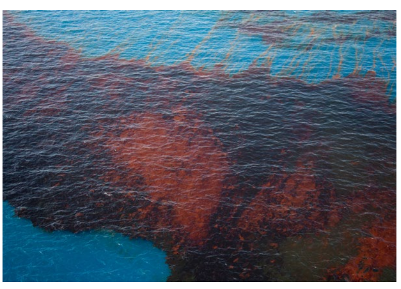
Oil from a spill in the Gulf of Mexico

Plants and animals are moving northward; glaciers are melting; storms and droughts are increasing in severity; and weather patterns are changing. Behind these weather patterns are changes in the Earth's atmosphere that scientists can track over geologic time. A tiny part of Earth's atmosphere is so-called greenhouse gases, which hold in heat reflected from Earth and do not let it escape into space. One of these greenhouse gases is carbon dioxide ( CO_2 ). During the glacial/interglacial cycles of the past million years, the CO_2 varied approximately 100 parts per million (ppm) — from 180 ppm to 280 ppm — due to processes not affected by humans. Since the Holocene and the beginning of human agriculture, the atmospheric concentration of CO_2 has risen from 280 ppm to about 390 ppm, much faster than ever before. This has happened mostly due to humans burning fossil fuels in the last 250 years. Leading scientists are now saying that we must reduce this